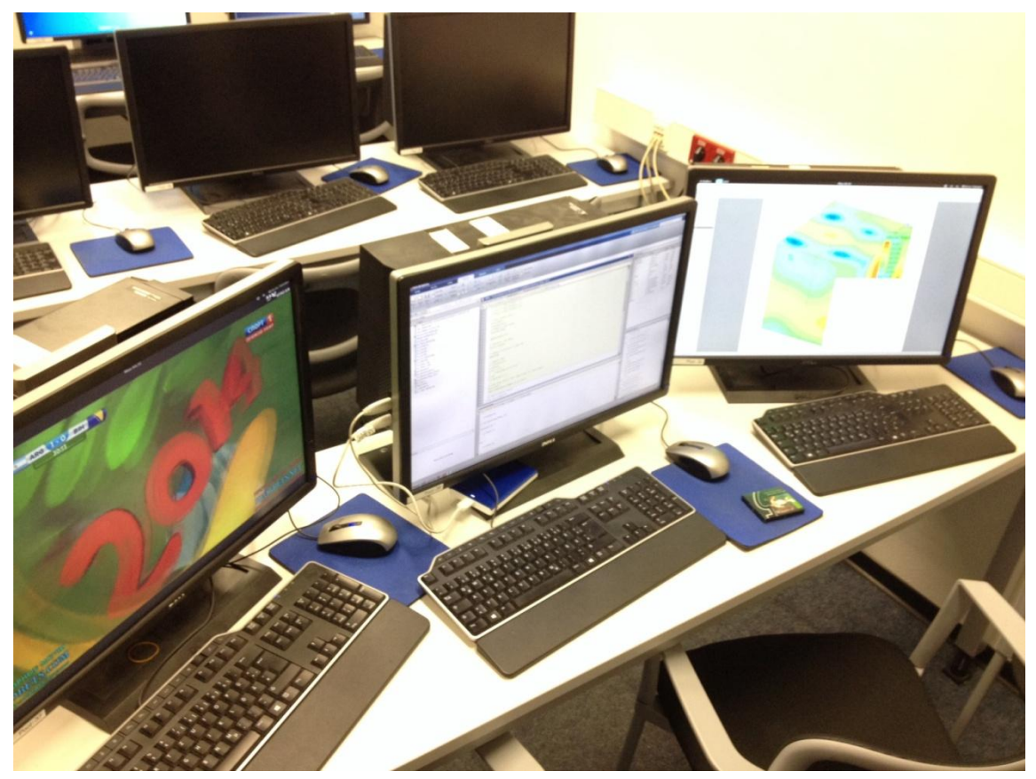
All this helped me to finish my complicated topic in time and became a Master of Mechanical Engineering afterwards.