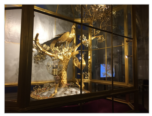
Figure 5: Peacock Clock

My favorite experience so far has been the State Hermitage Museum, as it is a vast museum of many items, paintings, sculptures, jewelry, and weaponry. Additionally items are shown from many different cultures. I spent an entire day in this museum (10:30am until 9pm) without even a lunch break, and I intend to go back in the near future to finish. To the right is an image of the animated "Peacock Clock" wich is beautiful demonstration of mechatronics.