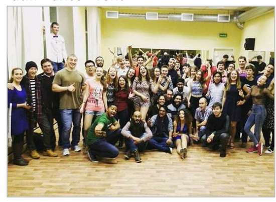
Orchestra (White Hall)