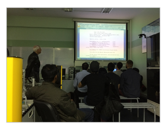
Figure 3: Studying Intelligent Systems

I and two other students also elected to take the first Russian course on reading, writing, and speaking. As expected, this proved to be very helpful in everyday life.